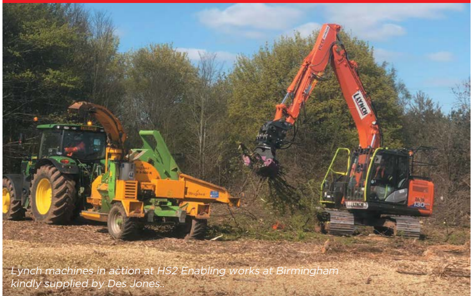
Lynch machines in action at HS2 Enabling works at Birmingham